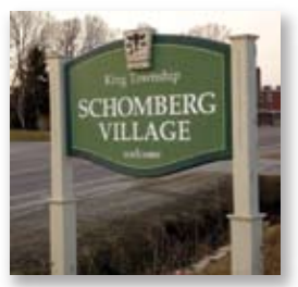
Welcome to Schomberg

Welcome to Schomberg, a community of approximately 2,500 residents, located in the northwest quadrant of the Township. Schomberg enjoys a diverse, balanced economy and lifestyle in a quaint village setting, steeped in tradition. To promote the quaint village atmosphere, local community groups work together in organizing a variety of events held throughout the year.